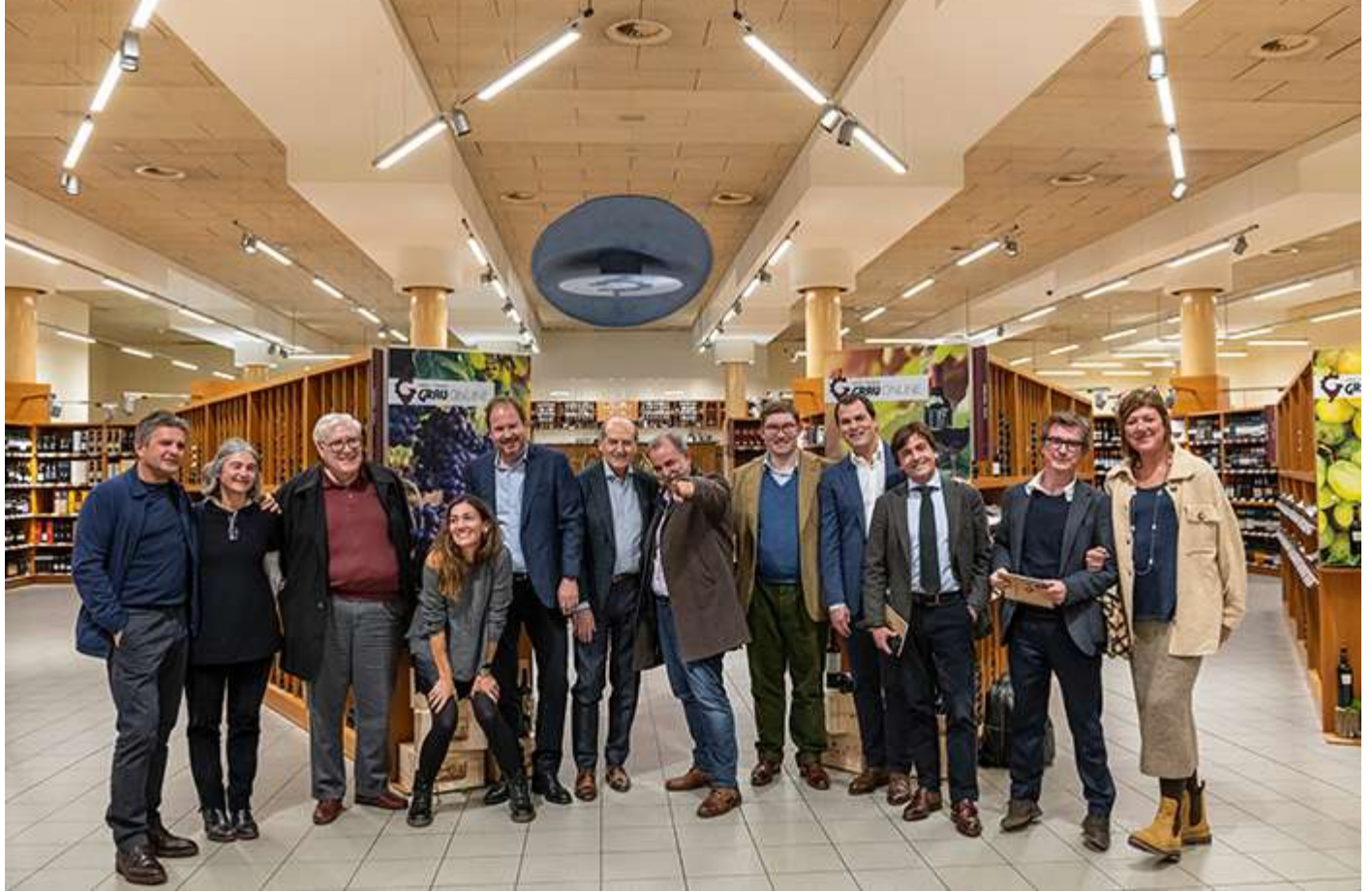
The happy participants of the tasting

f ( https://www.facebook.com/dialog/feed?app_id=1523507334639053&link=https%3A%2F%2Fwww.robertparker.com%2Farticles%2Fyt6snob6WF843 )