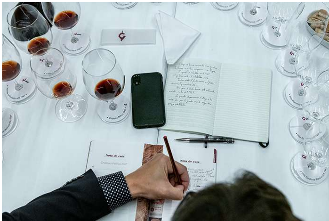
Everybody took detailed notes about the wines.

Gran Reserva wines for 10 years in barrel, plus 10 years in bottle and releasing them 20 years after the harvest.