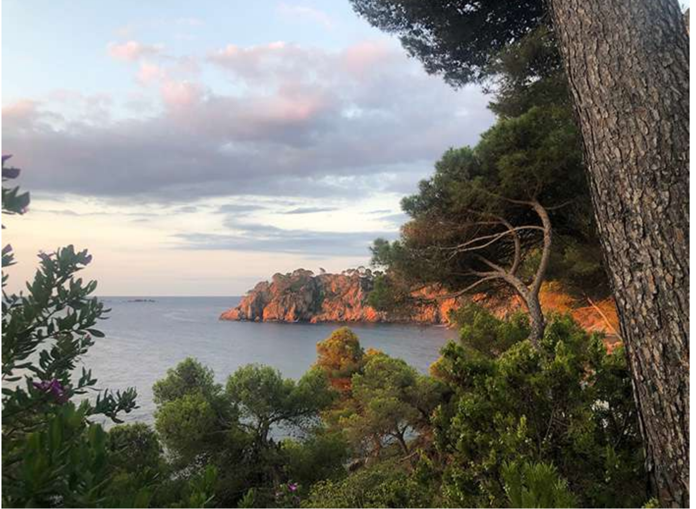
Palafrugell has one of the most spectacular landscapes of the Costa Brava.