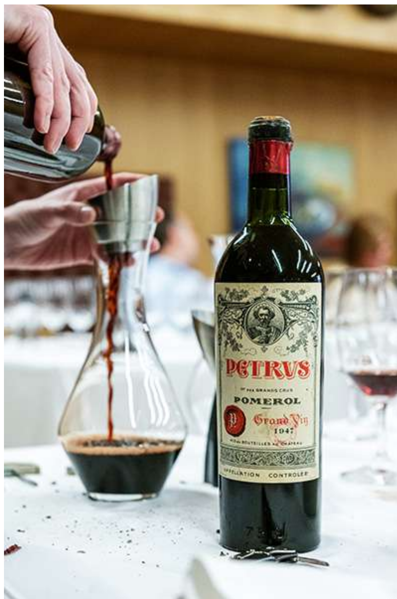
Petrus was one of the highlights from Bordeaux.

The warm fruit, with elevated sugar levels, was a challenge to ferment, as temperature control could only be achieved by resorting to dropping blocks of ice in the vats. In the circumstances, it's no surprise that many suffered from stuck fermentations and concomitantly elevated levels of volatile acidity: the famous Cheval Blanc 1947, for example, contains more than one gram per liter. Yet while a slightly balsamic, high-toned quality, combined with huge sweetness and concentration of fruit, is certainly one of the vintage's calling cards, it is often less distracting than the numbers would suggest. Some of the Right Bank wines attained what were for the time historically high alcohol levels, with Cheval Blanc, for example, checking in at 14.5%, and some seem to show a little residual sugar: again, Cheval Blanc contains 0.5 grams per liter. The Left Bank, however, was less extreme, with Mouton Rothschild landing at 12.5% alcohol, totally dry, and Haut-Brion, a ripe site, falling below 13% alcohol.