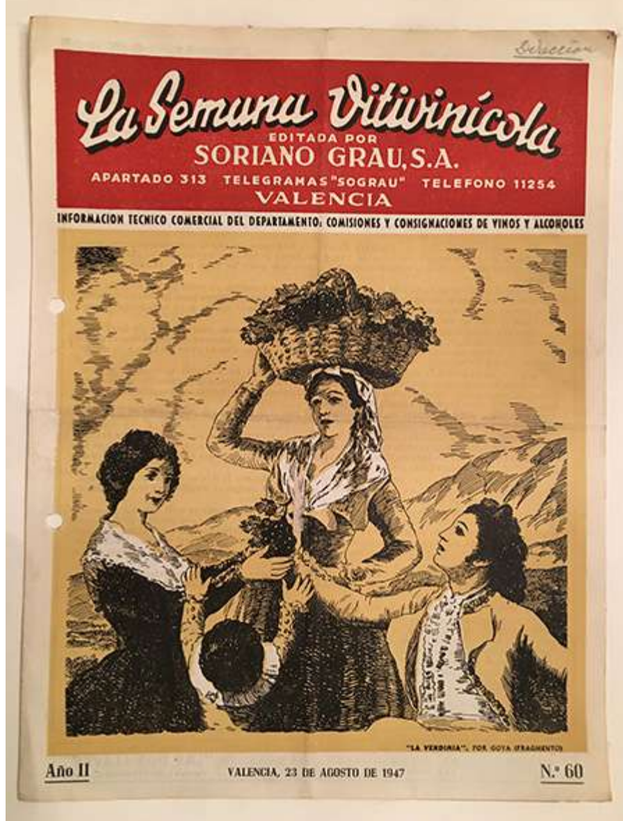
La Semana Vitivinícola, Spain's oldest wine journal, gave a forecast about the 1947 harvest in its issue number 60.

At the end of March 1948, they had a general meeting where they informed about the excellent quality of the 1947 harvest of perfectly ripe and healthy grapes. They started harvesting quite early, on September 29, a constant in low-yielding years, and finished on October 17 for the white grapes and on October 21 for the reds. They picked 202,424 kilograms of grapes, and a little more than half of it white grapes!