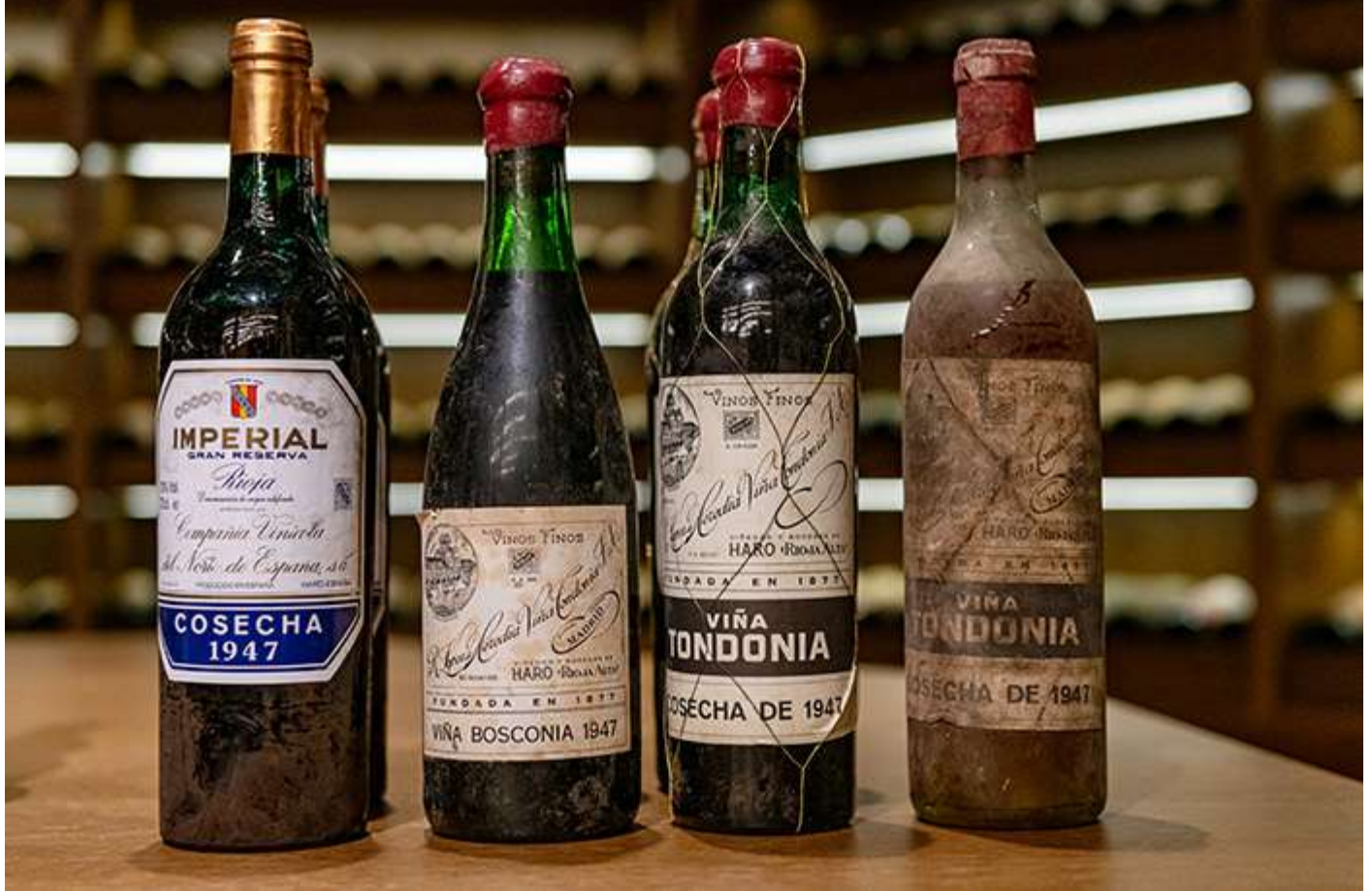
Some of the highlights from Rioja

This information is specific to López de Heredia, and there are some contradicting data elsewhere; but the reality is that there's very little good information about 1947 in Rioja... CVNE keeps records of older vintages, and what they have for 1947 was that it had a hot summer with relatively low aggregate annual rainfall, a year of drought throughout the growing season. At Marqués de Riscal, they have records of 1947 being a year of long vegetative cycle because of a cold winter. Despite the scarce rain, August was not dry, and September was quite wet. It was a short but high-quality crop.